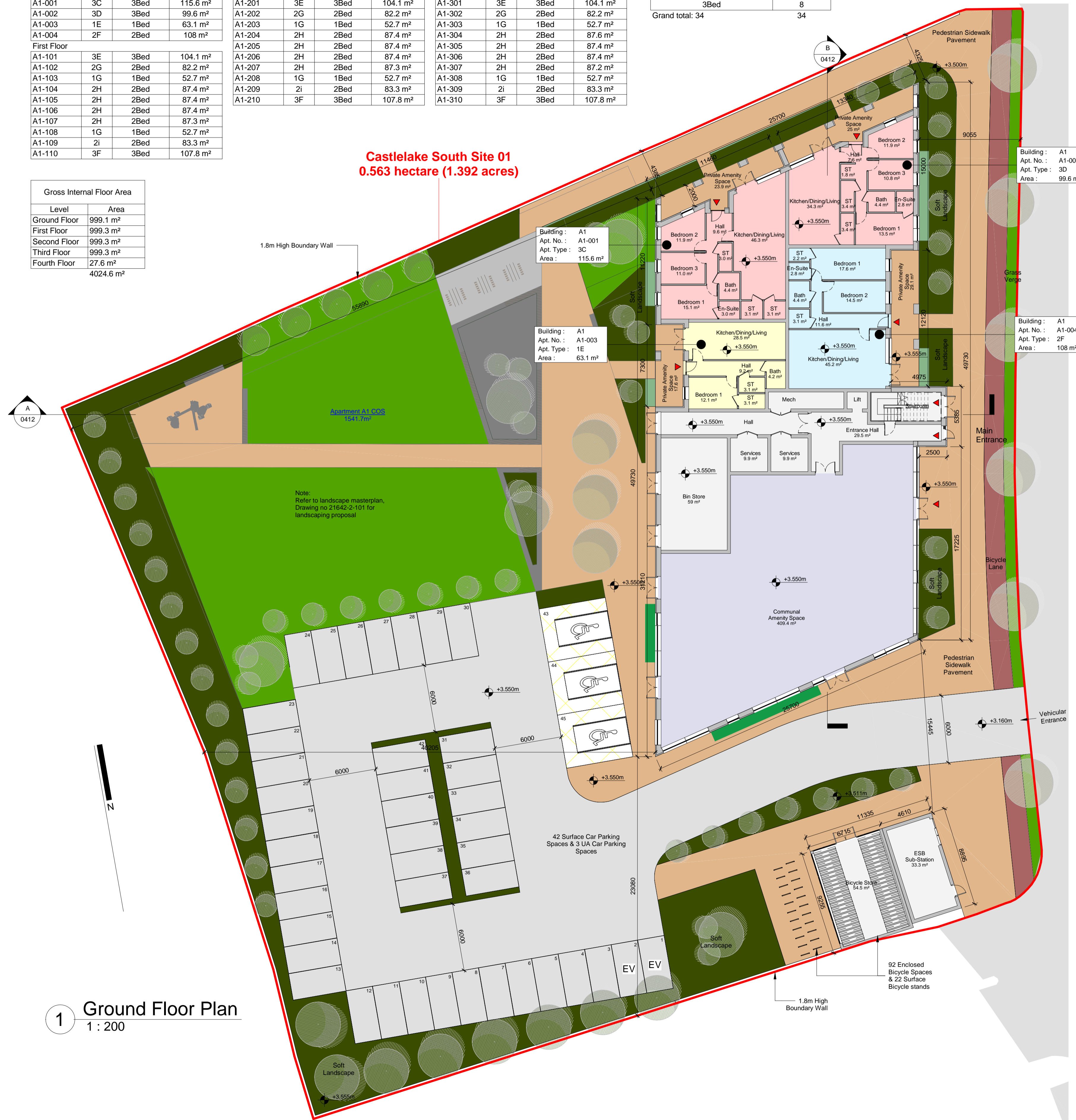
1 Ground Floor Plan 1 : 200