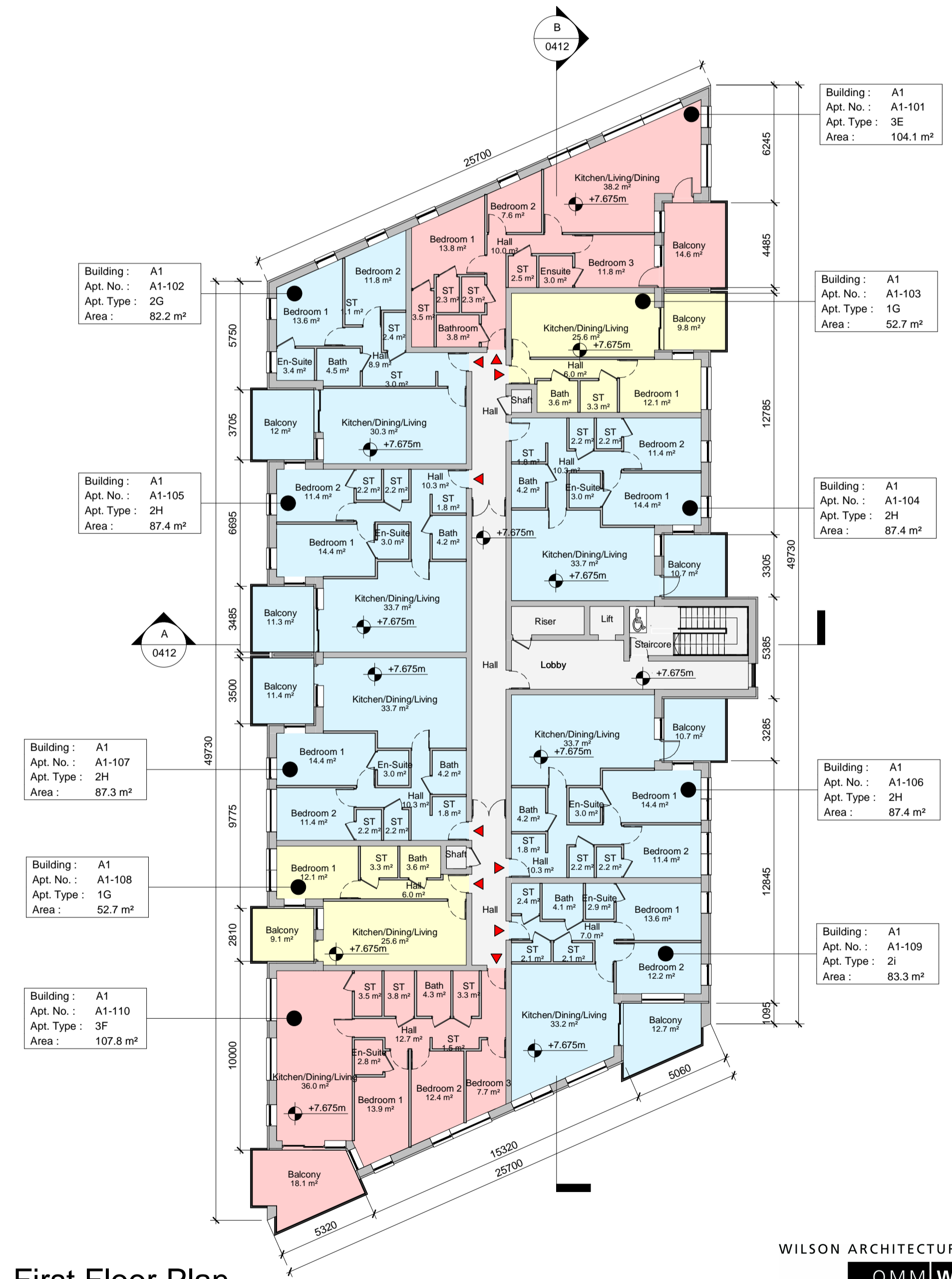
2 First Floor Plan 1 : 200

NOTE: Refer to Architect's Design Statement for selected material & finishes on buildings.